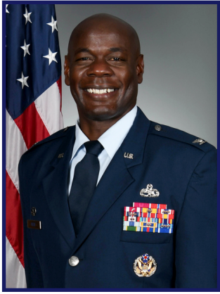
COL DEEDRICK REESE Commander, Installation & 78th Air Base Wing