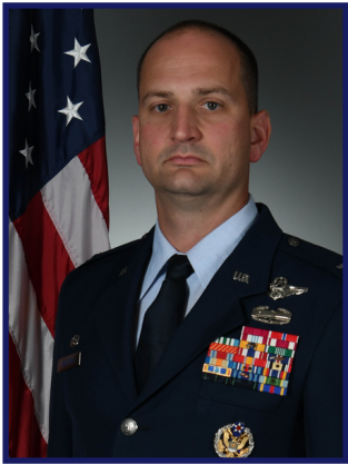
COL ADAM SHELTON Commander, 461st Air Control Wing