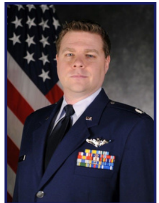
LT COL RYAN COX Commander, 350th Spectrum Warfare Wing/Detachment 1