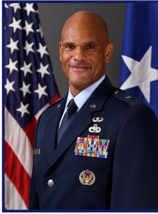
BRIG GEN KELVIN MCELROY Commander, Air Force Reserve Command Force Generation Center